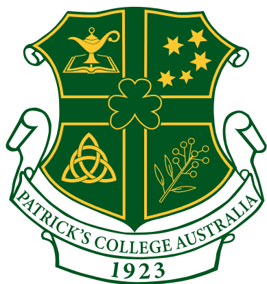
The Official Coat of Arms of Patrick's College Australia (PCA)